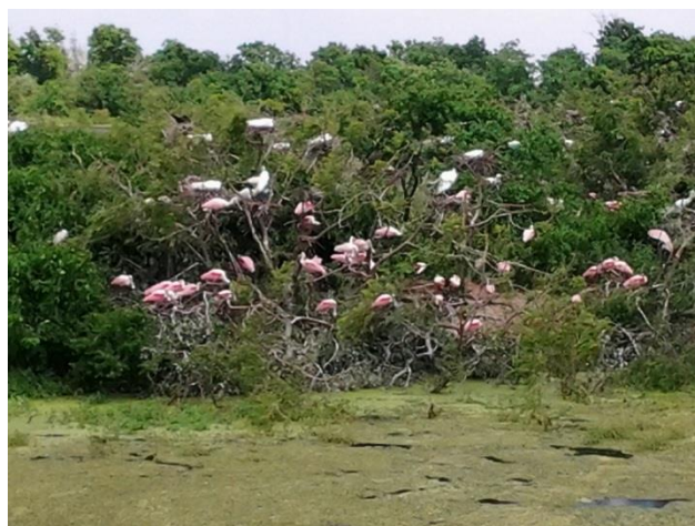
High Island Rookery