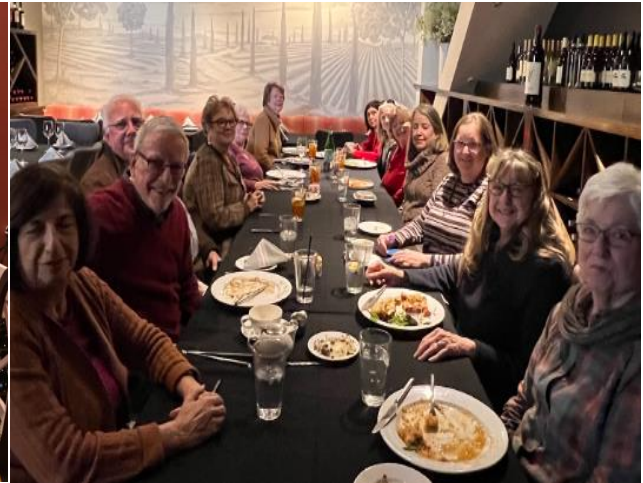
Lunch with the Garden Divas