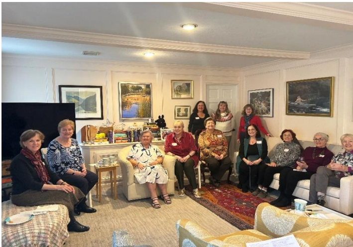
Newer members attend January Afternoon Delight