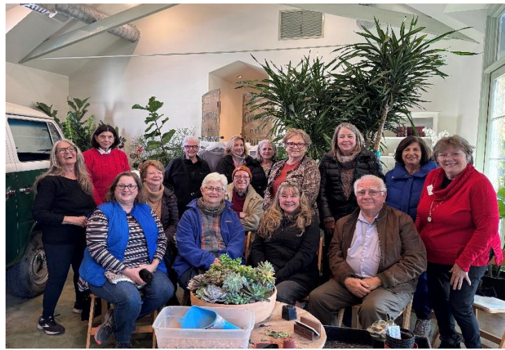
Garden Divas visited the Thomson + Hanson Stone House