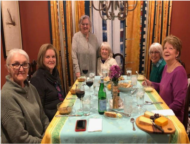
Soup before Books Dinner Party for book club leaders