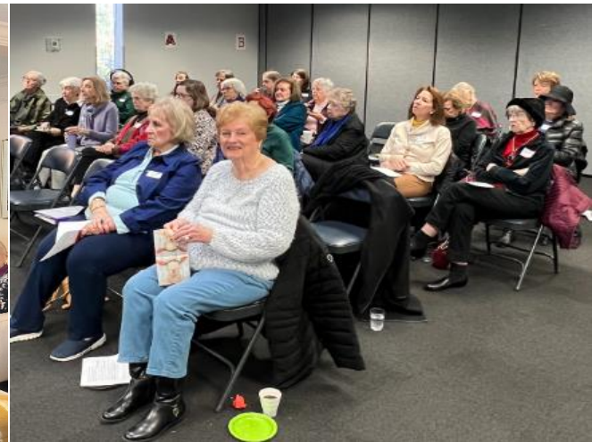
January meeting at Tracy Gee Community Center