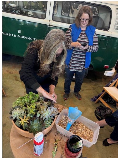
Garden Divas get a demonstration on making a succulent bowl