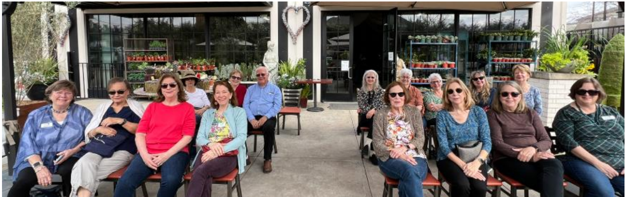
Garden Divas February outing to the River Oaks Plant House