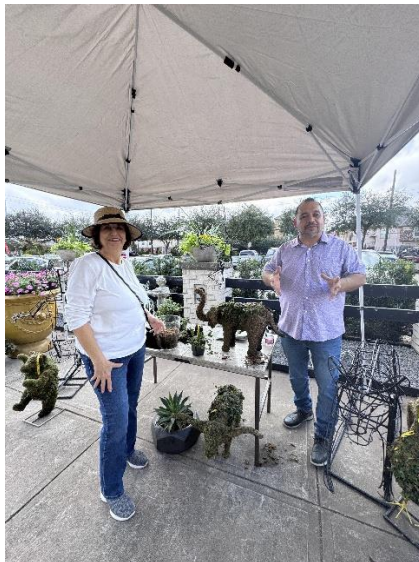
Demonstration at the River Oaks Plant House